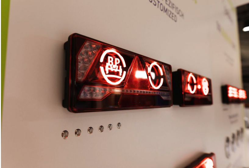
Customized rear lights from Ermax put the brand identity in a whole new light

ERMAX logo lighting: the BPW subsidiary Ermax is presenting a new generation of its LED rear lights, which display the logo of vehicle manufacturers as a characteristic light signature. This clever and cost-efficient solution now also allows medium-sized vehicle manufacturers to present their brand identity in an impressive manner.